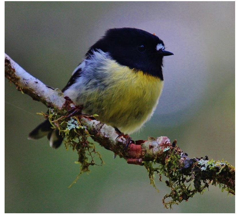
A beautiful Tomtit in Fiordland

December 14, Day 15: Northern Fiordland National Park and Milford Sound. Today will be dedicated to exploring spectacular Fiordland National Park, which includes Milford Sound. While taking in this incredible fiord and the stunning photographic opportunities it allows, we will need to be on the lookout for the scarce Fiordland Penguin. This spectacular crested penguin is restricted to these cold, deep waters and a sighting will be a great bonus, as they are difficult to see. As we retrace our steps back to Te Anau, we will be scouting for some very special birds in incredibly spectacular surroundings. At the Homer Tunnel, we will search for the mischievous Kea—a parrot with a penchant for chewing up windshield wiper blades. Higher up on the scree slopes lives the diminutive South Island (Rock) Wren, a representative of the New Zealand wren family, but unfortunately recent road closures due to avalanche concerns make it unlikely for us to encounter it. In the dense beech forests live more special birds like the South Island Tomtit, the Rifleman (a close relative of the Rock Wren), the rare Yellowhead, and the dapper little Pipipi (Brown Creeper). We have had success searching for the rare Blue Duck in this area. We will bird our way to Milford Sound for our boat trip on this world-famous, spectacular sheltered waterway.