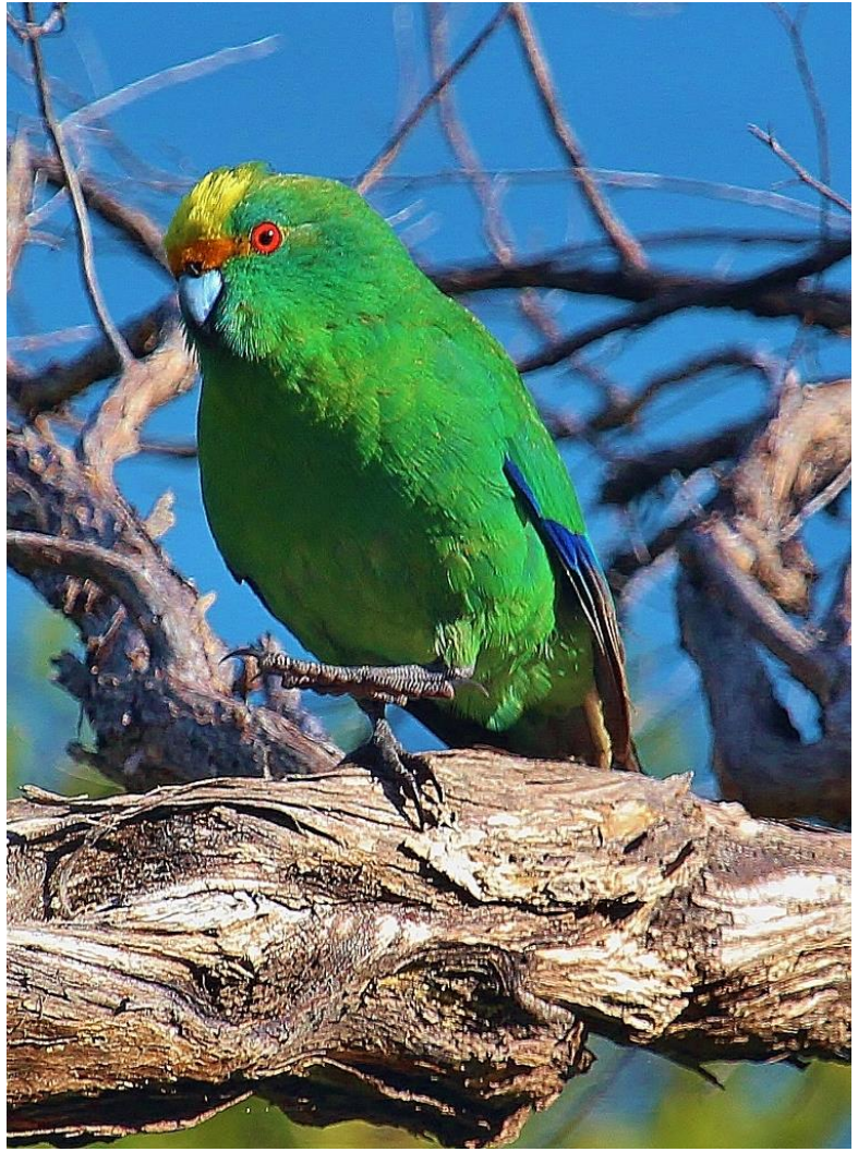
The rare Malherbe's (Orange-fronted) Parakeet can sometimes be found in Picton.

Kaikoura is famous for its marine life, and the seabirds here are truly phenomenal. You have to venture only one mile offshore before you are in the deep ocean. This is New Zealand's equivalent of Monterey—only there are a lot more birds. By placing "baitballs" off the back of the boat, we can lure in incredible numbers of very tame albatrosses and petrels, including rare endemic Westland Petrel; White-chinned